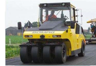
Elasticated Asphalt Rollers-3 pieces