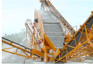
Crushing-Screening Plant-2 pieces