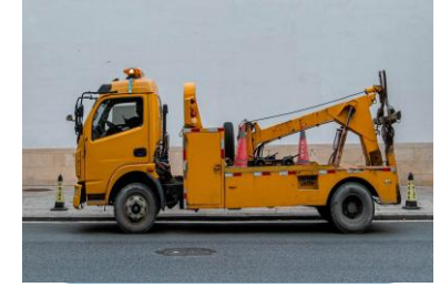
Tow Trucks-2 pieces