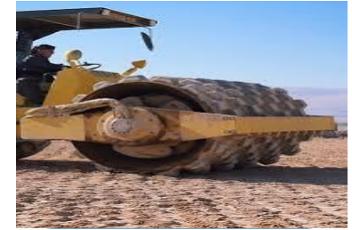
Soil Rollers-2 pieces