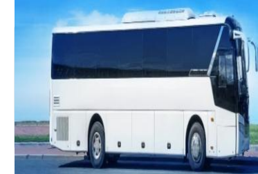
Service Bus-2 pieces