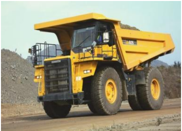
Dumper Trucks-4 pieces