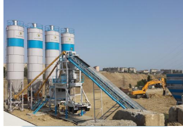
Concrete Plants-2 pieces