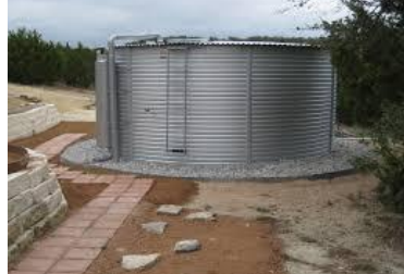
Water Tank-2 pieces