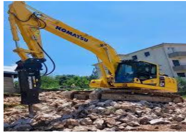
Drilling And Breaking Machines-2 pieces