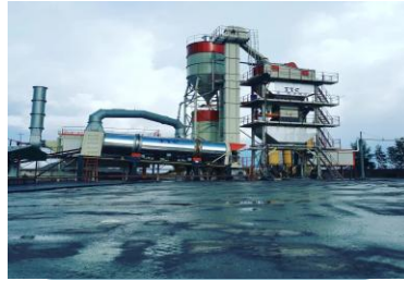
Asphalt Plants-4 pieces