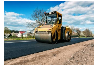
Asphalt Rollers-2 pieces