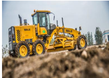
Dozer and Grader-3 pieces