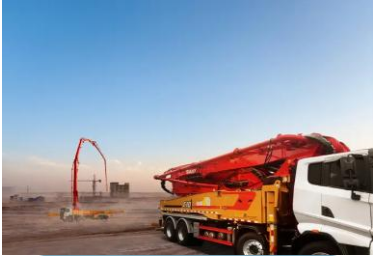
Concrete Pump Car - 2 pieces