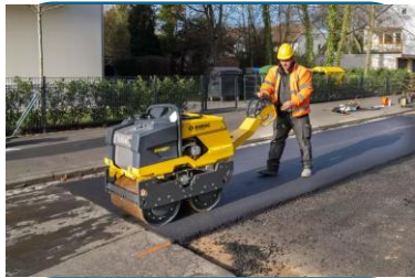
Patch Rollers-3 pieces