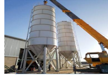
Cement Silos-2 pieces