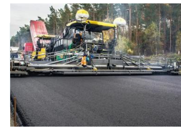
Asphalt Paver Finisher-4 pieces