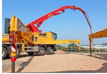
Concrete Pumps-2 pieces