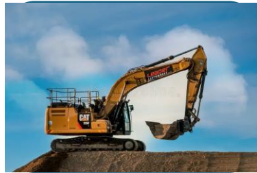
Excavator And Loader-1 piece